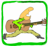
playing the guitar