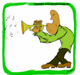
playing the trumpet