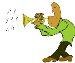
playing the trumpet